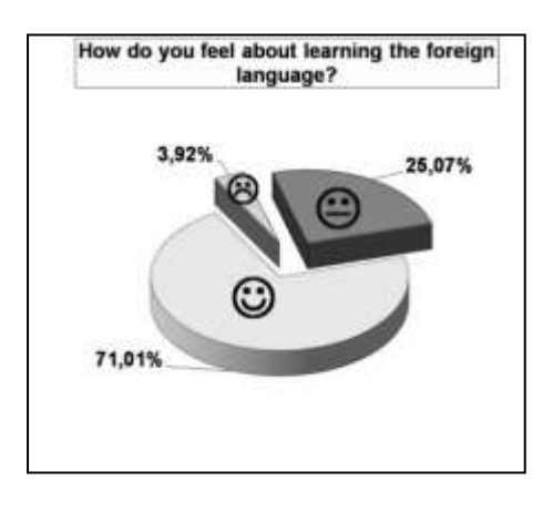
Figure 5: YLs' feelings about FLL at start of project.

The decline in levels of enjoyment from 71.01% to 68.1% was only slight, but the further decline in the percentage of children who were less certain about their enjoyment of FL learning (from 25.07% to 20.2%) and the subsequent increase in the numbers of children who considered that they no longer enjoyed learning a FL (from 3.92% to 11.7%) was statistically significant.