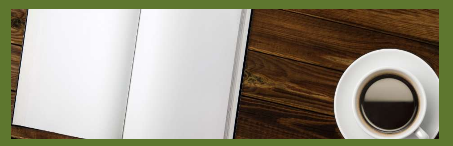
Spring 2013 Issue 28

THE NEWSLETTER OF THE IATEFL RESEARCH SPECIAL INTEREST GROUP